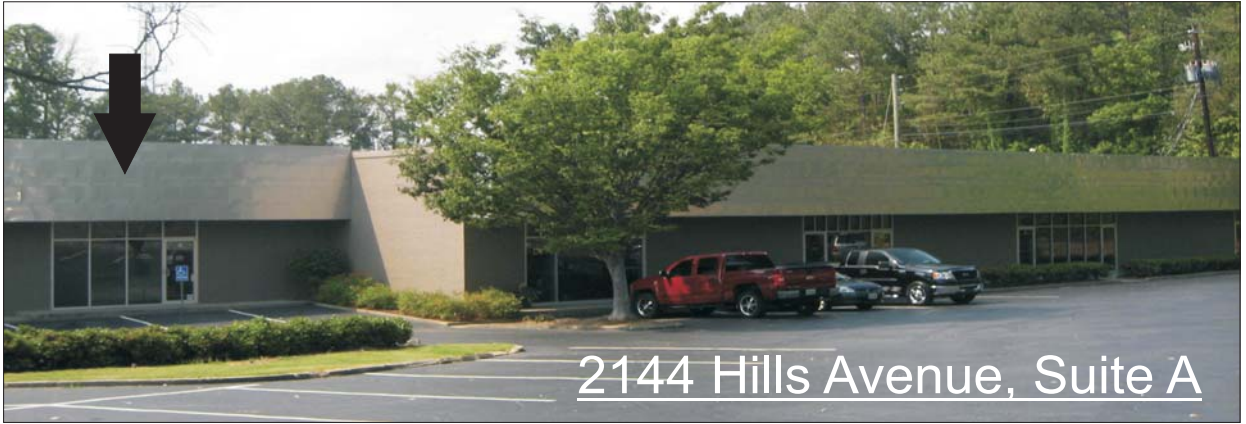
2144 Hills Avenue, Suite A

7,678 Square Feet of Office and Sound Stage or Photography Studio Space